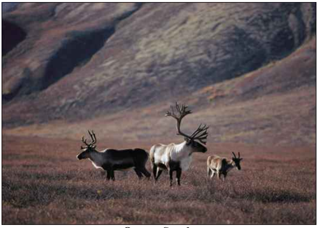
Once a Staple

By Jennifer Viegas, Discovery News From: http://dsc.discovery.com/news/2007/12/20/reindeer-meat-cavemen.html?dcitc=w19-502-ak-0000