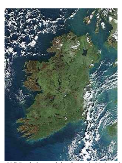
The "virtual Ireland" collaboration between UC Berkeley and the Queen's University aims to create "a comprehensive, multi-disciplinary digital library of e-resources relating to Ireland."

That may be about to change, thanks to a joint project between the University of California, Berkeley, and the Queen's University of Belfast, Northern Ireland. Their digital collaboration, "Context and Relationships: Ireland and Irish Studies," aims to better connect Irish studies materials and to make them easily accessible 24/7 from anywhere with a quick click of the computer mouse.