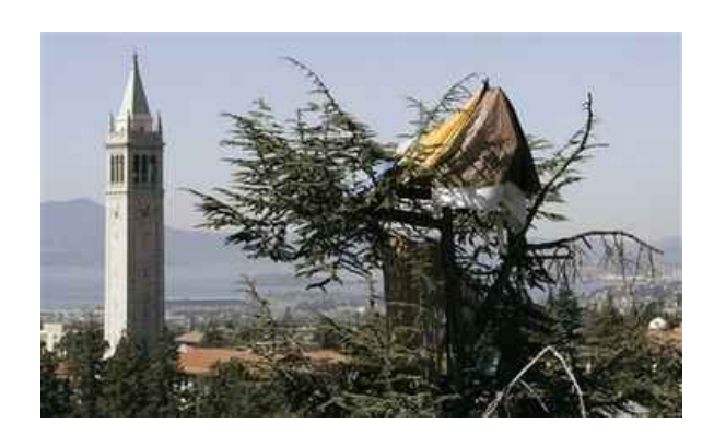
Thu Nov 22, 4:55 PM ET

University of California officials have won the legal right to oust a band of tree-sitters who've taken up residence in an oak grove standing in the way of a planned sports center.